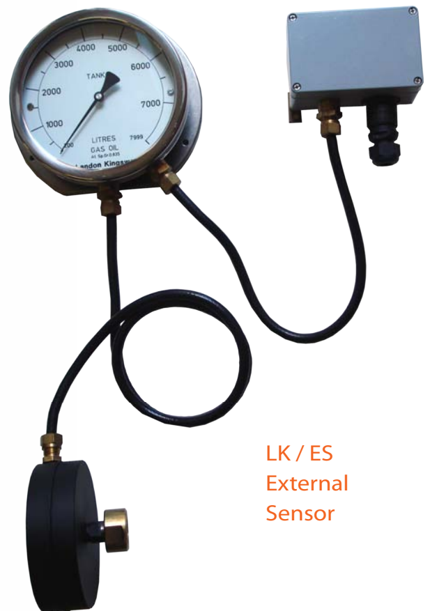
LK / ES External Sensor